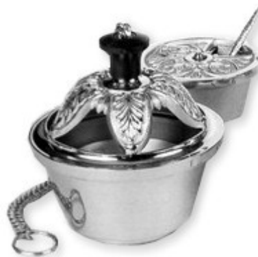
Thurible/Censor & Boat