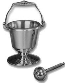
Aspergillum/Sprinkler & Holy Water Bucket