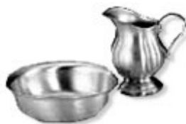
Lavabo Bowl & Pitcher (for the Hand Washing)